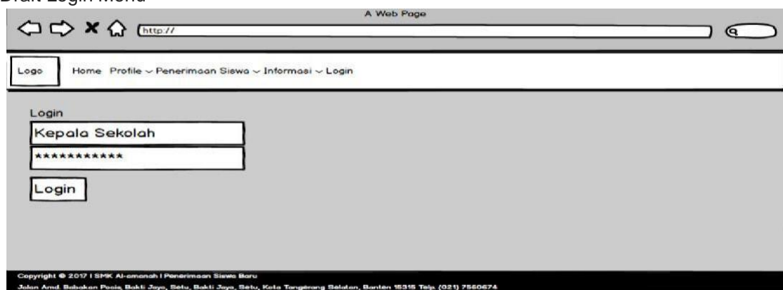
Figure 1. Draft Login Menu.

Figure 1. explain the process of students and headmaster to access the site and log in to their account